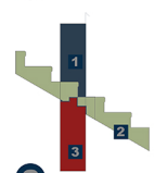
C Nodo scala - muro scale